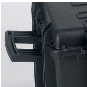
TWO MAN LIFT SIDE HANDLES